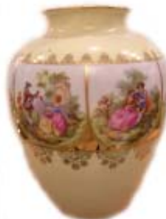
An impressive 'Love Story' hand painted Porcelain VASE from Germany. 12" high. c.1950-60. Can.$595 USD$494