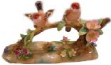
A hand painted Porcelain BIRD GROUP by J. Jones, Crown Staffordshire, England. c.1950 Can.$225 USD$191