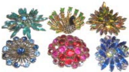
The hottest Costume Jewellery on the market today! A collection of coloured Rhinestone BROOCHES from the 40s & 50s. Price: $65 and up