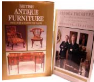
Price Guide to Antique Furniture $105 & Hidden Treasures by the Keno Bros. $42.95