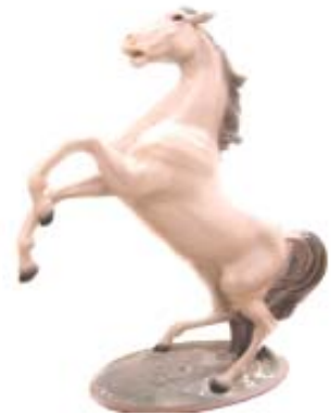
A prancing porcelain STALLION from Germany. 12" high. c.1950 $195