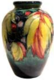
A MOORCROFT 'leaf & berries' VASE. note minor restoration to rim. 6.5" high. 1930s. Can.$650 USD$540