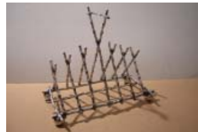
A super Silverplated TOAST RACK from England. c.1920 Can.$475 USD$404