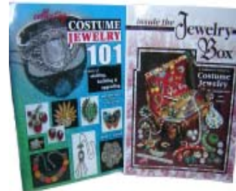
Two brand new titles on Costume Jewellery. Costume Jewellery 101 $32.50 & Inside the Jewellery Box @ $32.50 also.