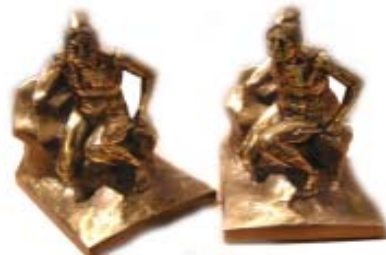
A pair of bronzed red Indian BOOKENDS. Approx. 6" high. USA c.1960. Can.$375 USD$319