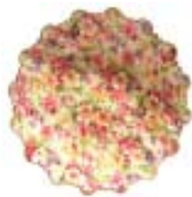
A Chintz 'Du Barry' BOWL from James Kent, England. 7" diameter c.1935-50. Good condition $175.00 USD 149

From all of us at Hampshire Antiques Ltd. we wish you very Happy Holidays and hope that the New Year brings you health and happiness.