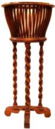
An Oak FERN STAND. Prob. North American and c.1920-40. 32" high Can.$375 USD$319