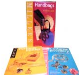
A selection of Miller's Collector's Guides @ $14.95