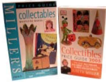
Miller's Collectables 2004/5 $39.95 & Judith Miller's Collectables 2005 $35 both softbound & all colour.