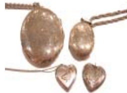
A small selection of sterling silver LOCKETS all under $150