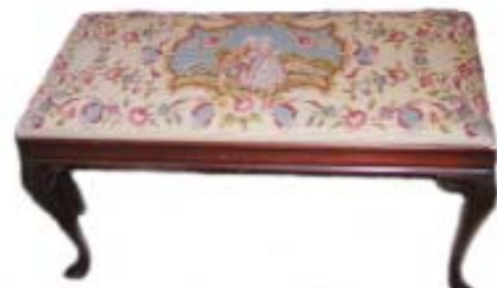
A Mahogany BENCH with a tapestry top. USA c.1940 32" x 15.5" wide Can.$575 USD$489