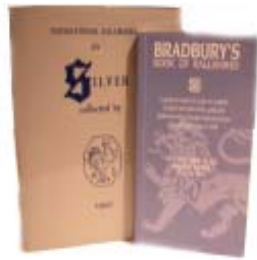
Bradburys Book of Hallmarks $18 & Tardy's International Silver Marks $65