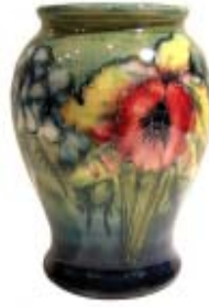
A MOORCROFT 'Orchid' VASE 5.5" high. Signed. 1930s $695 USD$570