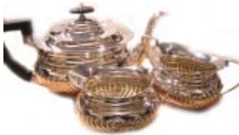
A three piece Sterling Silver TEASET from England. Hall-mark B'ham 1915 $695 USD$591