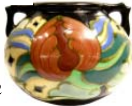
A GOUDA VASE from Holland. Unmarked so c.1906-17. $4.75" high $195 USD$162