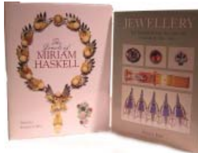
Jewels of Miriam Haskell. Hardcover. $74.50 & Jewellery Intl. era 1862-1910 $138.50