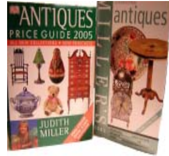
Judith Miller's Antiques Price Guide 2005 $50 & Millers Antiques Price Guide 2005 $50 . Hardcover & all colour.