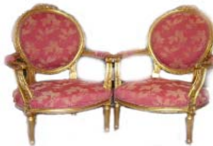
A fine pair of Giltwood ARMCHAIRS re-upholstered with an expensive fabric. Probably French and early 20th cent. $3,500 USD $2,975