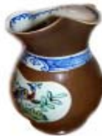
An English Pearlware JUG. Note restoration to rim. England. early 19th cent. as is. $195 USD$165